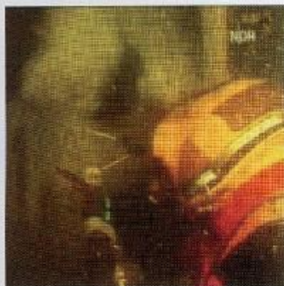
UHPAB underwater gun with balancing water jet

Mühlhan Equipment Services GmbH has announced the development of an underwater gun based on its ultra-high pressure water jetting and abrasive (UHPAB) technology. The gun features a special valve which directs part of the water flow in the opposite direction of the cleaning jet.