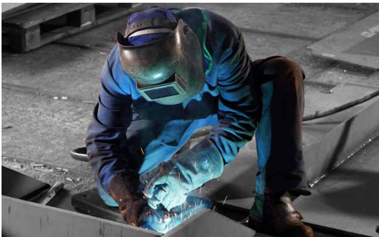
Steel worker welding