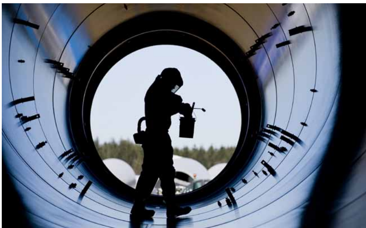
Interior coating of a wind turbine tower